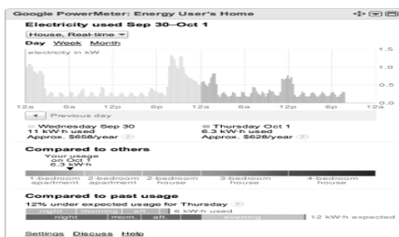
TED Power Monitor Works With Google Powermeter To Analyze Your Power Use

Other Power Saving Options: Solar Dynamics Solar Powered Attic Vent: Cool your hot summer attic w/o any energy cost Efficient Power Strips: Reduce “Phantom” Loads. The Energy Detective: Monitor your daily energy use. See your energy use online Energy Efficient CFL Light Bulbs Air Cycler: Keep Air Even In All Rooms